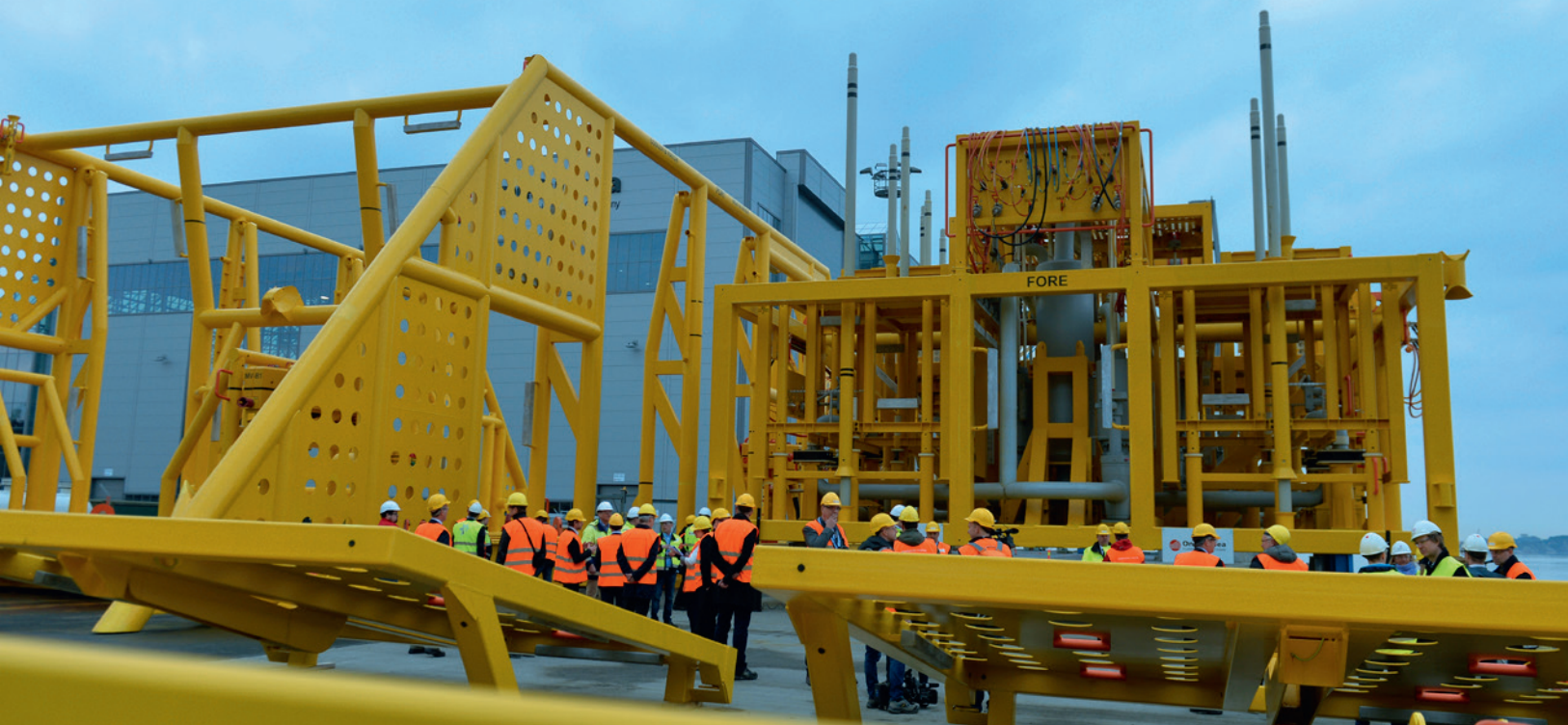
Gullfaks Wet Gas Compressor.

Total production during the first half averaged 1 046 thousand boe/d, compared with 1 001 thousand boe/d in the same period of 2014. Output of oil and natural gas liquids (NGL) rose by 3.5 per cent, while gas production was up by five per cent. Total sales of equity production for the SDFI averaged 1 057 thousand boe/d, an increase of 6.3 per cent from the first half of last year.